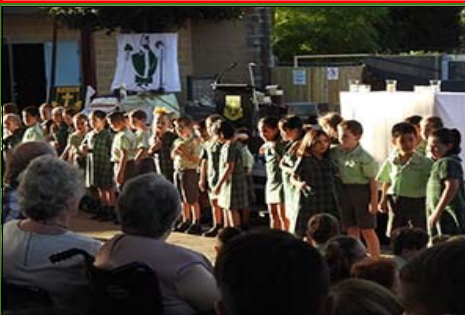
Above: Our very reverent students