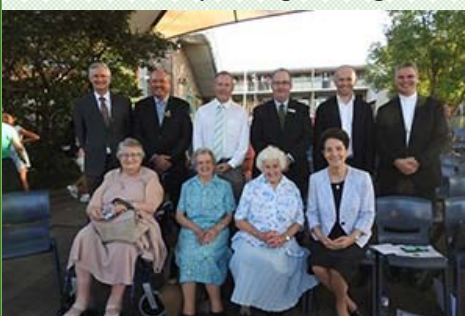
Below: Our very distinguished guests